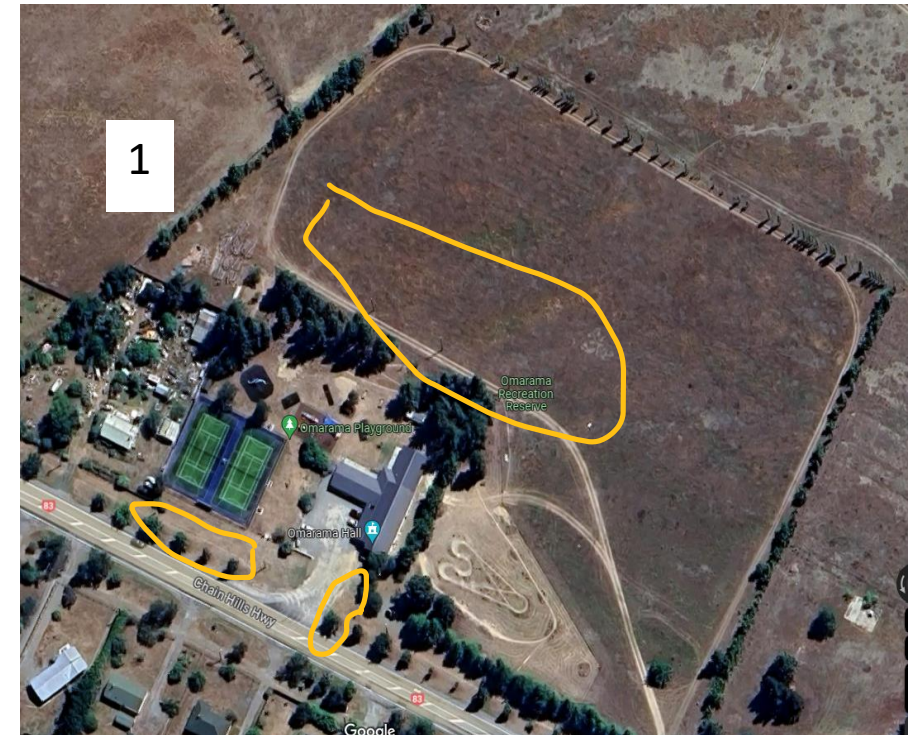
Community Hub area