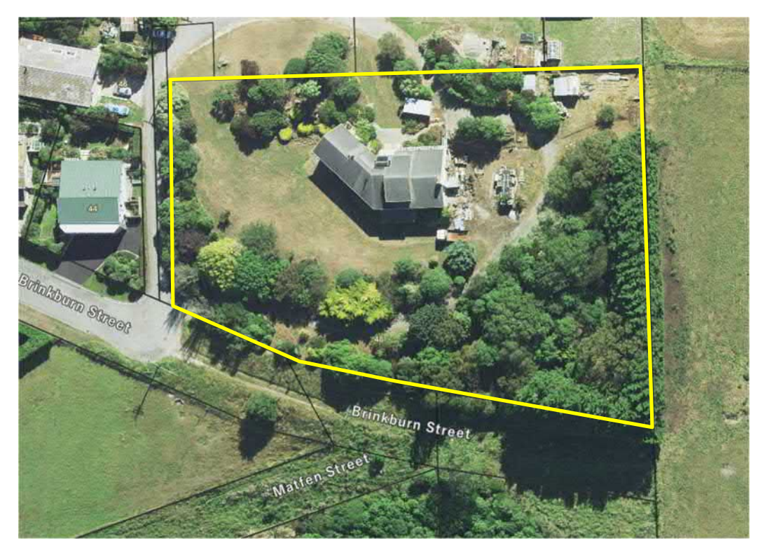
Figure 2: Aerial photograph of the site showing the existing established residential character.

Given the existing environment within the site, there is no need for the Coastal Area of Degraded Natural Character overlay to apply to this property.