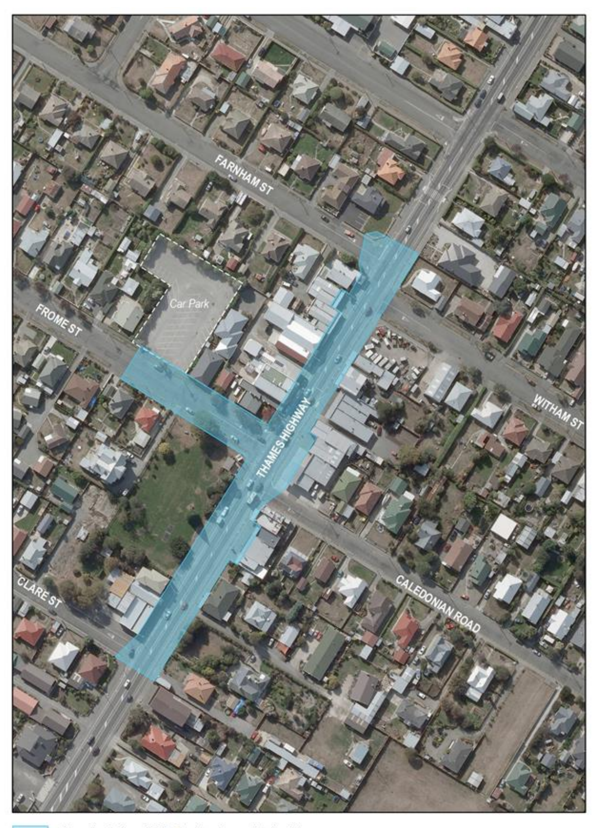
Roading Bylaw 2020 - Traffic; Second Schedule