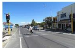
Streetscape review north-end Ōamaru - $75,000