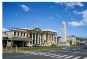
Ōamaru CBD revitalisation - $841,000

Allocated amount: $1,765,000 over 3 years – including 7% overhead to deliver