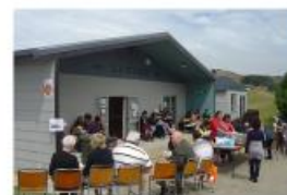
Housing Enabling Officer