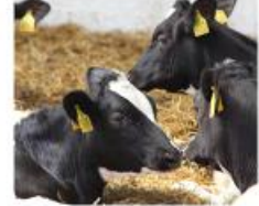
Diversified / sustainable farming transitions