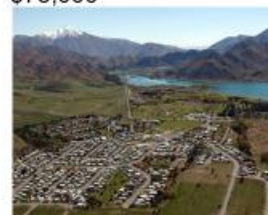
Otematata placemaking projects (Masterplan) - $225,000