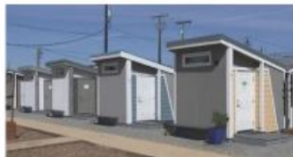
Affordable Housing Development Scheme