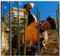
Upgrading skills of local workforce

Co-designed between WDC and Te Rūnanga o Moeraki