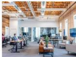
Business incubator scheme