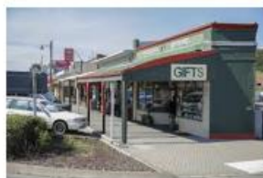
Palmerston placemaking - $225,000