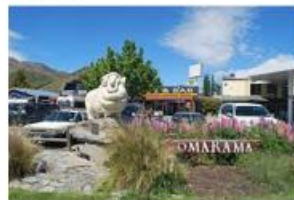
Ōmārama town centre (Masterplan) - $225,000