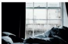
Healthy Homes Scheme

Developed in partnership with Te Rūnanga o Moeraki