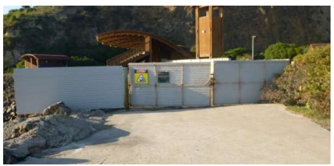
Figure 8: Signage and fenced area at base of breakwater.