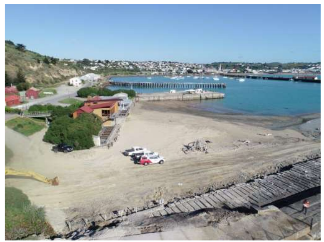
Figure 3: Aerial view of beach.