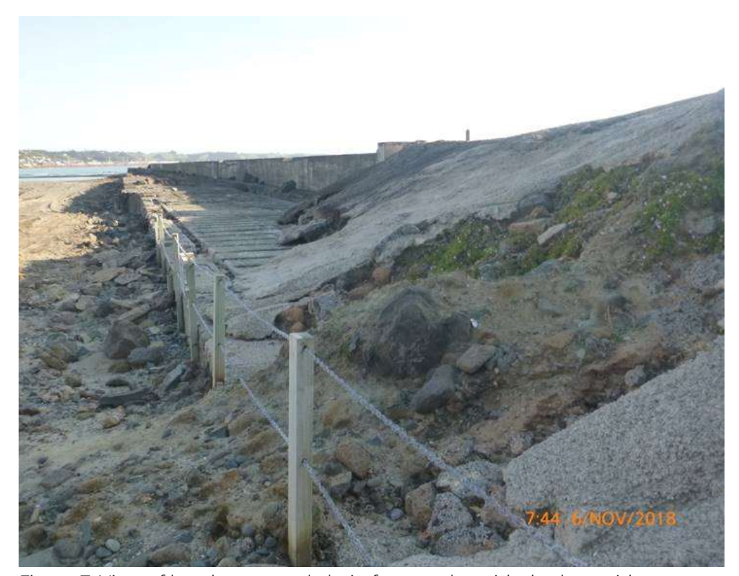
Figure 7: View of breakwater and chain fence at low tide, harbour side.