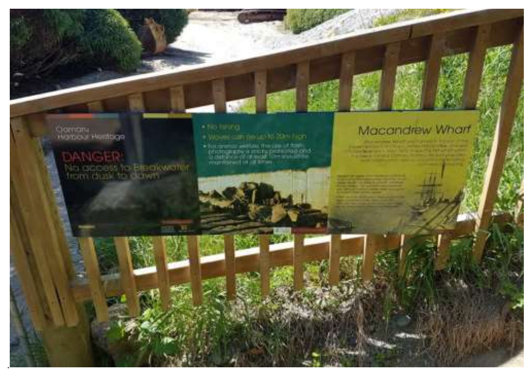
Figure 5: Signage on fence next to gate-access to beach.