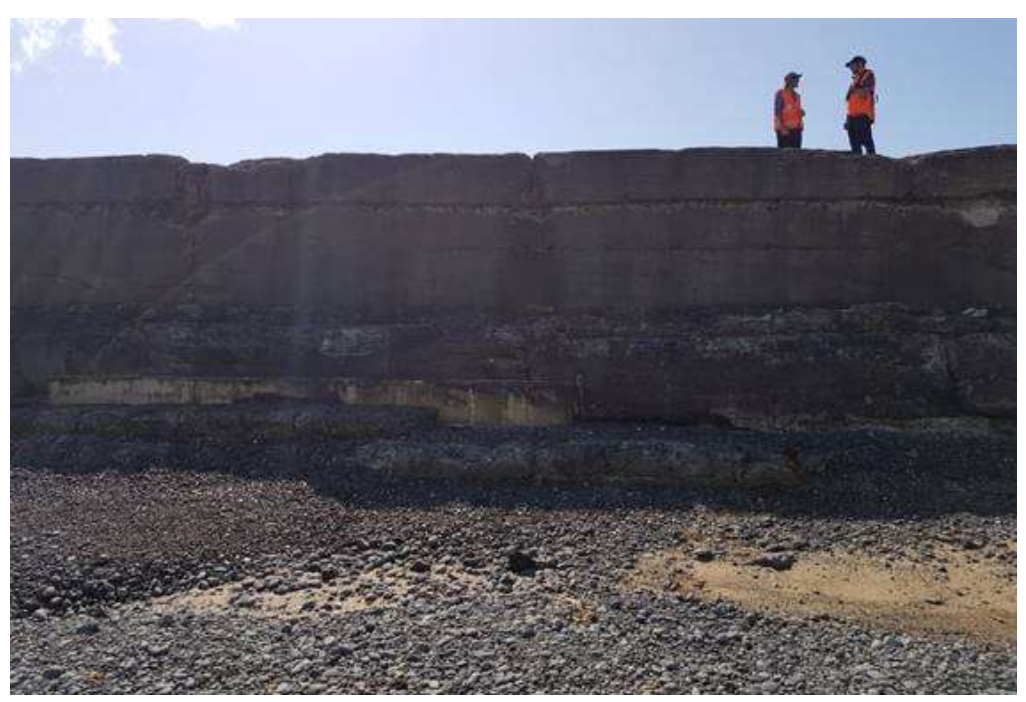
Figure 4: Unguarded heights on the harbour side of the breakwater.