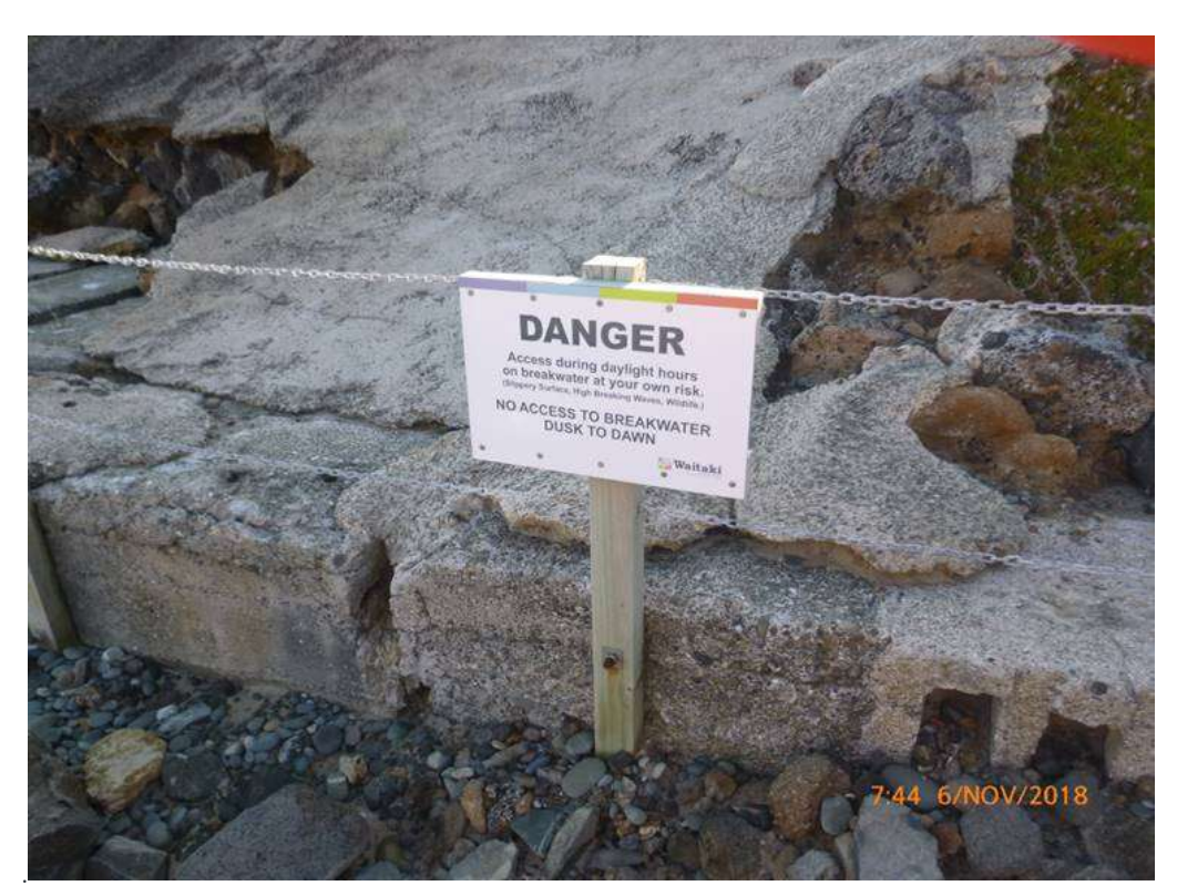
Figure 6: Signage next to chain fence at base of breakwater, harbour side.