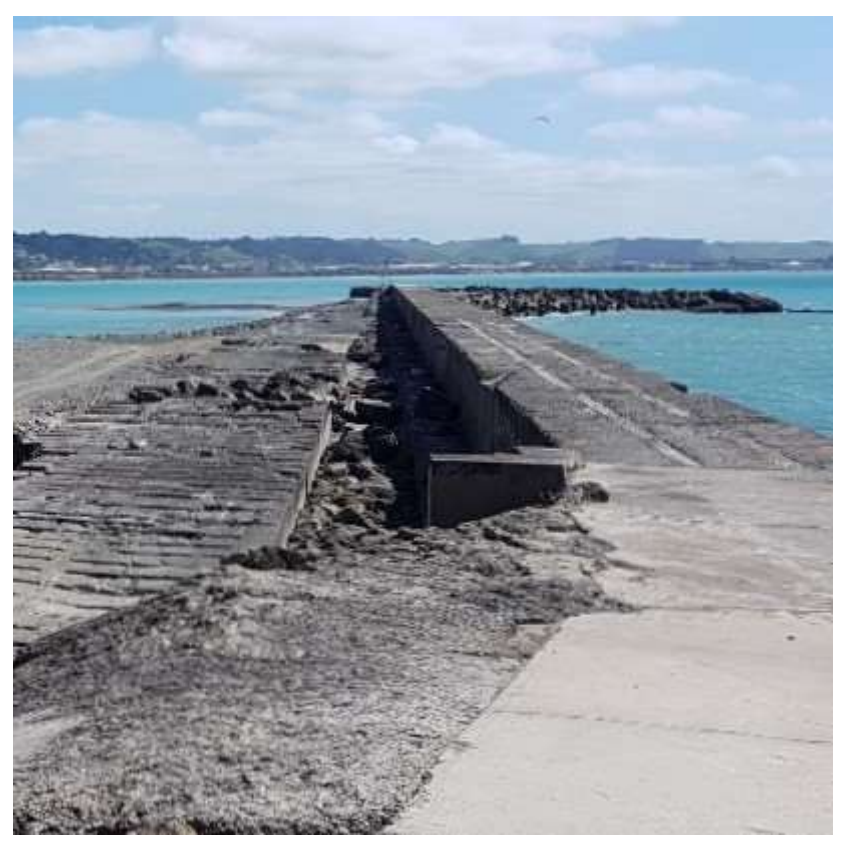
Figure 2: View of breakwater from base.