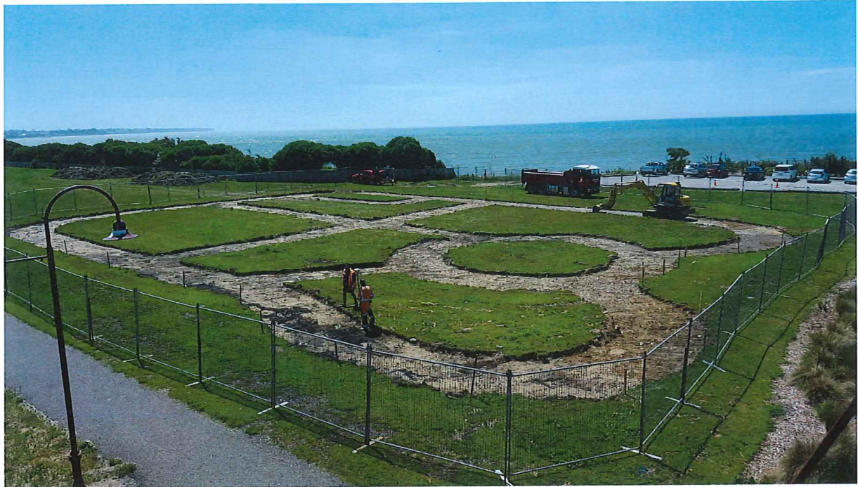
The layout takes shape!