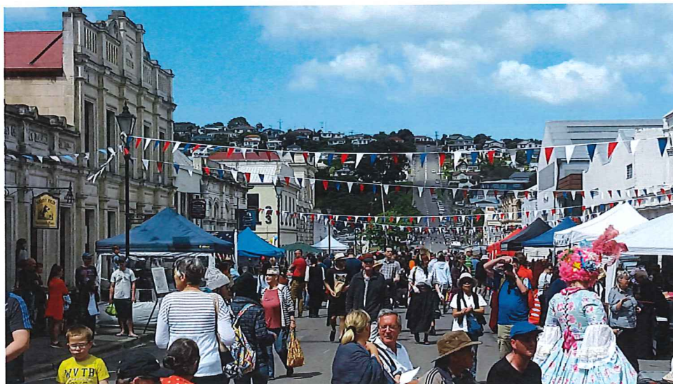
Photos from the Network Waitaki Heritage Celebrations Fete