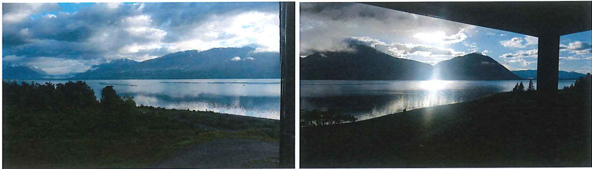
The Waitaki District!