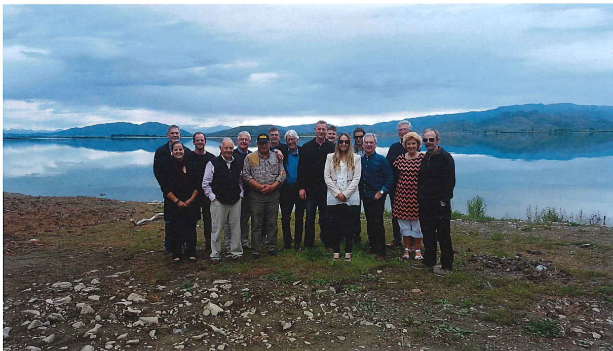
A strategic bunch...

For the second session, we were joined by the senior managers, and went into more detail on a number of topics. They added in some of the issues which they felt were important, and we had a very good, interactive session. For a new Council, I felt there was a very high level of goodwill, ability, and a real sense of having a common direction. It bodes well for the term ahead of us! There will be a couple more sessions to further discuss the issues that we didn't have time for, and we will schedule those soon.