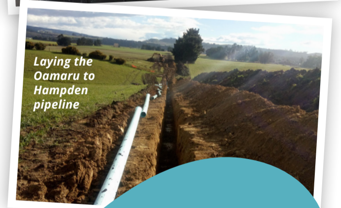
Laying the Ōamaru to Hampden pipeline

In the next article we will look at the proposed governance structure of the reforms, the financial implications and what new standards could mean for septic tank users and small suppliers.