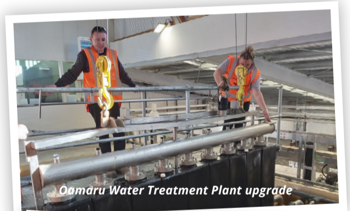
Ōamaru Water Treatment Plant upgrade

These are aspects where we know change is needed. We need to build stormwater systems where we currently don't have any, we need to increase the capacity of our stormwater systems in a number of places, and we will likely need to treat at least some of that water to remove pollutants before it can be discharged to a water body, be it a creek, stream, river, and even just a gully.