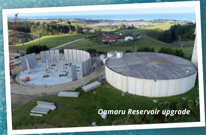
Oamaru Reservoir upgrade

Hi, I'm Gary Kircher, Mayor for Waitaki. This is the first in a series of articles which will look at what the Government's proposed 3 Waters reform might look like for Waitaki, so you get a picture of the decisions that our councillors will have to make, after we have had a chance to survey your thoughts on the matter.