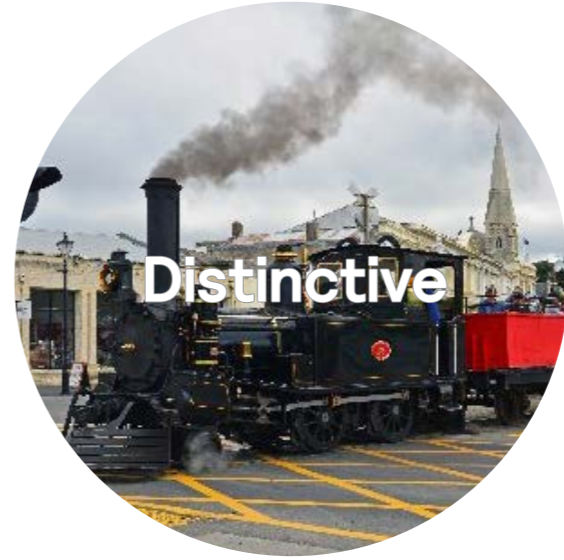
Protecting and enhancing the town centres experience, quality and landscape setting as a visitor draw card_