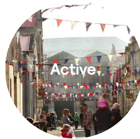
Provides and supports a wide range of city, waterfront and event activities_