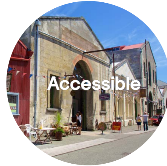
Accessible, legible and connected by foot, cycle, car and coach_