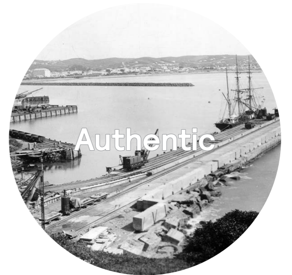
Enhancing/maintaining the unique landscape and cultural heritage of the town centre_