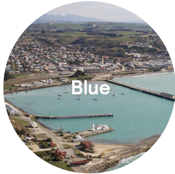
Maintain the functionality and quality of the harbour waterspace_