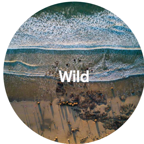
Improving access to and around the town centre via other modes (bus, walk, cycle, water)