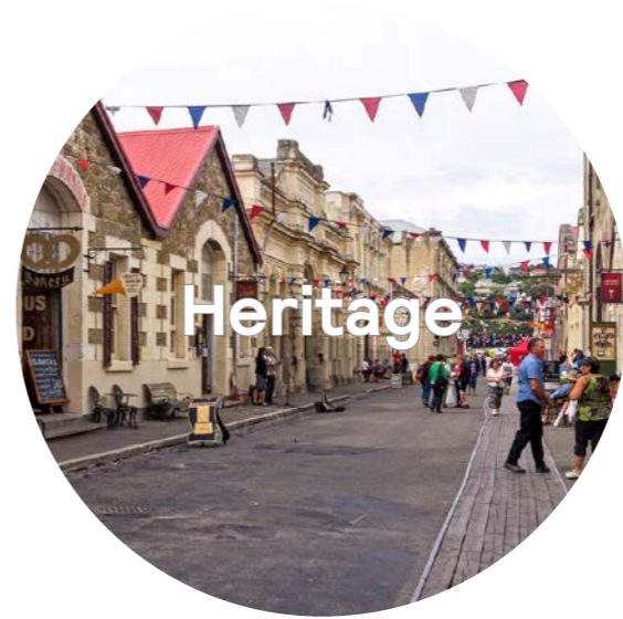
Compliment and enhance the Whitestone Buildings Heritage and connection to town and waterfront_