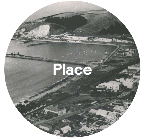
Reveals stories of Oamaru and the waterfront. Place based and people focussed_