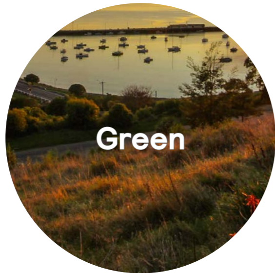
Enhancing the sustainability and environmental quality of the town centre