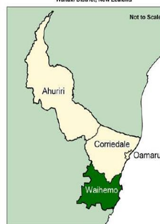
Waihemo Ward, Waitaki District