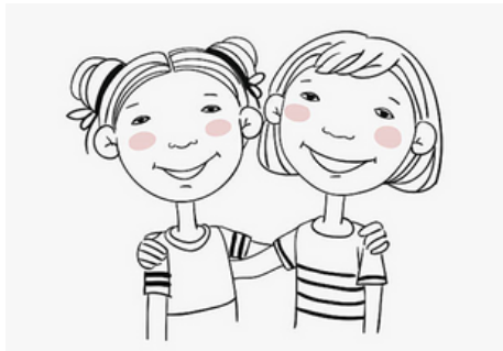
Younger sister of sister or younger brother of brother