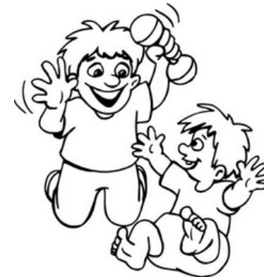
Older brother of brother or older sister of sister