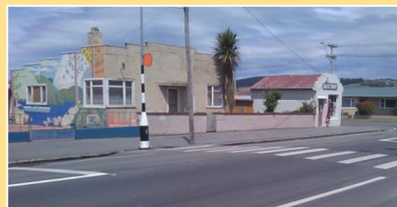
Reed Street Pedestrian crossing

Council is trialling a new material on the Reed Street pedestrian crossing outside St Joseph's School. Earlier this month, the final application of the 3M Stamark™ tape was installed as an alternative to remarking the crossing with traditional paint. This new material provides improved slip-resistance for pedestrians and cyclists as well as reflective ceramic beads to help improve the night time visibility of the crossing.