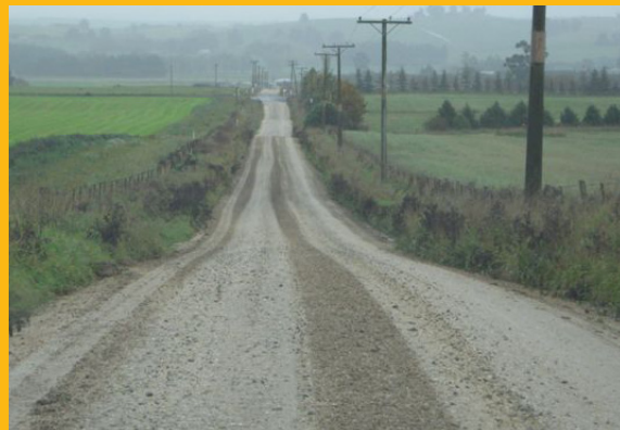
After grading on the same road, but differing location